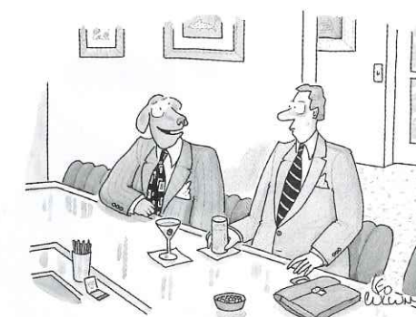
© The New Yorker Collection, 2000. Leo Cullum from cartoonbank.com. All Rights Reserved.

Figure 63.1 is worth spending some time on. Try grabbing a study buddy and explaining whether each of the five conditions provides more support for nature or more for nurture. In most cases, it's some of each and you have to look at comparisons between categories to really be able to draw conclusions.