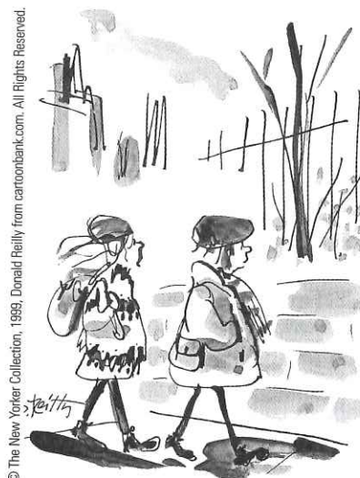
"I told my parents that if grades were so important they should have paid for a smarter egg donor."

heritability the proportion of variation among individuals that we can attribute to genes. The heritability of a trait may vary, depending on the range of populations and environments studied.