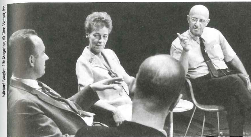
Active listening Carl Rogers (right) empathized with a client during this group therapy session.

Can a therapist be a perfect mirror, without selecting and interpreting what is reflected? Rogers conceded that one cannot be totally nondirective. Nevertheless, he believed that the therapist's most important contribution is to accept and understand the client. Given a nonjudgmental, grace-filled environment that provides unconditional positive regard , people may accept even their worst traits and feel valued and whole.