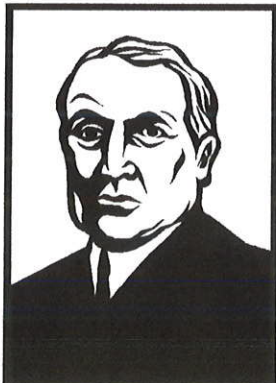
Warren G. Harding

I wanted to get the economy back on track after the war.